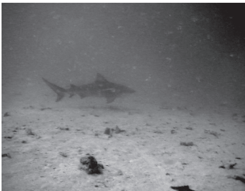
Figure 1. A bull shark ( Carcharhinus leucas ) about 120 cm total length (TL) swimming at a depth of 29 m, north-east of Toulou on Vava'u, Tonga.

Sharks of the genus Carcharhinus are rather uniform, become increasingly stocky and develop a straighter, more erect first dorsal fin with growth, and can be difficult to distinguish from one another in the field. The Tongan sharks are most similar in external morphology and dentition (from the jaw specimen), to the bull shark, C. leucas and the Java or pigeye shark, Carcharhinus amboinensis . These are similar, large, heavy-bodied, short-nosed, small-eyed species that have often been confused in the past but are readily separable (Bass et al., 1973; Garrick, 1982; Compagno, 1984, Last & Stevens, 1994). From C. amboinensis , the bull shark differs in its lower, less erect first dorsal fin and higher, more erect second dorsal fin. The ratio of first:second dorsal height is 3:1 or less in C. leucas , but over 3:1 in C. amboinensis . Furthermore, the bull shark has narrower lower tooth cusps, and slightly greater lower anteroposterior tooth counts (usually 12 to 13, versus usually 11). Figure 1 shows the ratio of first:second dorsal height to be approximately 2:1 and tooth count on each side of the lower jaw is 13. We are confident from their body and fin morphology, coloration,